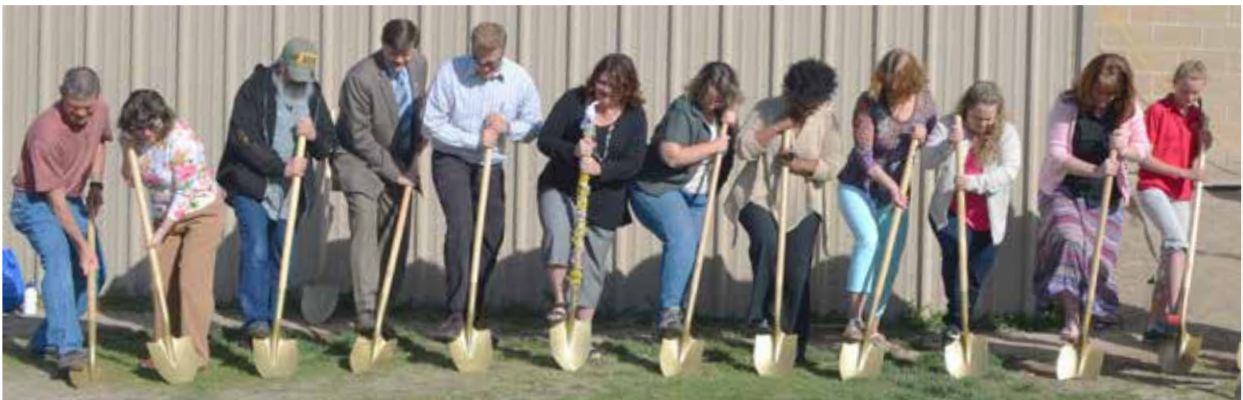
Pocatello Community Charter School groundbreaking ceremony brings community together.

Financial woes were — and are — the most common reasons for failure among Idaho charter schools. Idaho ranks 49th in the nation in per student spending. 36 Seven of the nine charter schools that have closed since 1999 cited financial problems as the main reason for closure. 37 Despite the financial challenges, however, there were 50 public charter schools operating in Idaho in 2017 and they collectively served more than 22,000 students, or about seven percent of the state’s public school K-12 population.