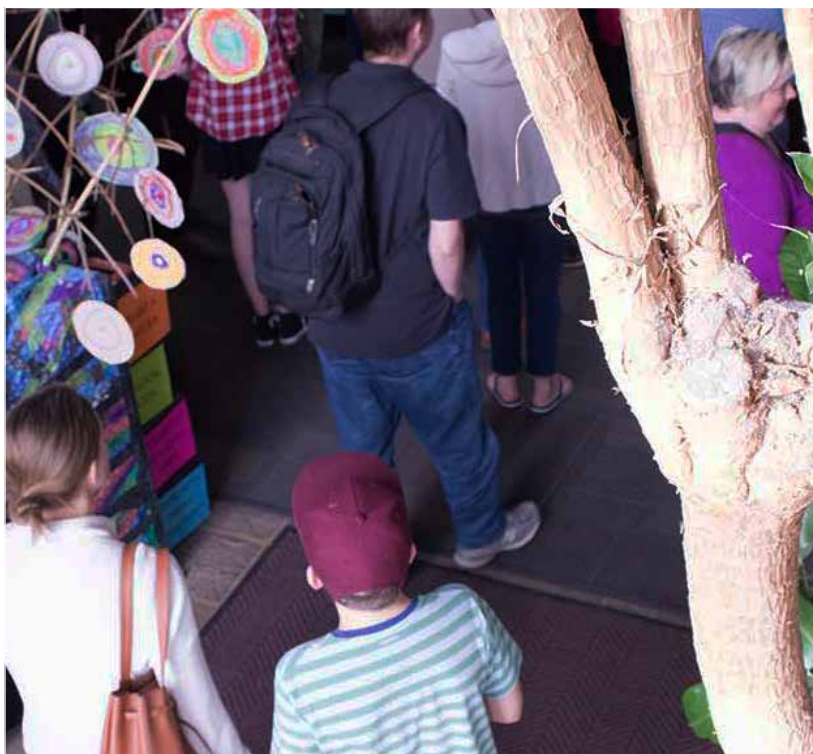
Families crowd the lobby of Anser Charter School during Exhibition Night.