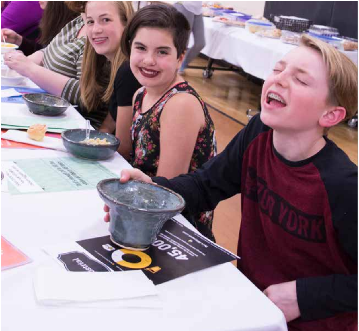
Students learn about the food they eat, from farm to table.