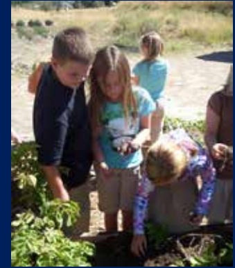
Students learn through exploration which extends beyond the walls of the school building.

"We just figured, very naively, that the world would be their classroom — they wouldn't need any textbooks," Hulet said.