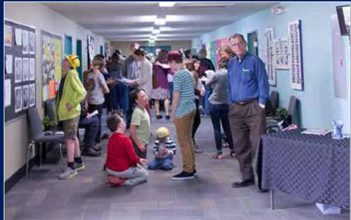
Students share their project-based learning with parents.

ANSER might be the most famous charter school in Idaho. It has certainly received the most media attention: As Boise's first charter school, it was put in the spotlight early. It has retained the limelight thanks to its test scores, its boundary-pushing math program, and its focus on teacher autonomy and education.