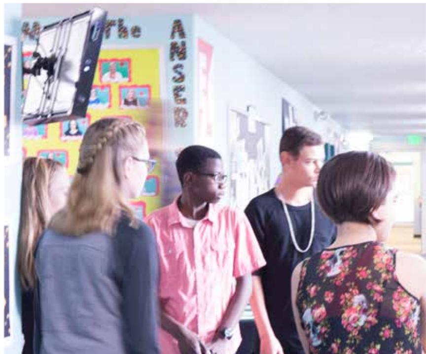
Students greet incoming families during Exhibition Night at Anser Charter School.

What could Idaho's public charter school sector deliver in the next 20 years if they were given some of their operational flexibilities back?